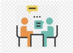
5. ORAL BOARD EXAMINATION