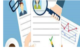
3. APPLICATION SCREENING