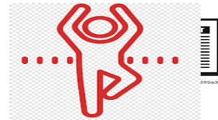
11. PHYSICAL DEMANDS/ DRUG SCREEN