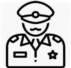
9. COMMAND STAFF INTERVIEW