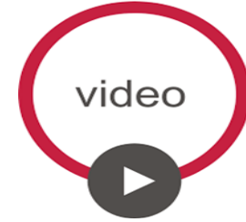
4. VIDEO TESTING